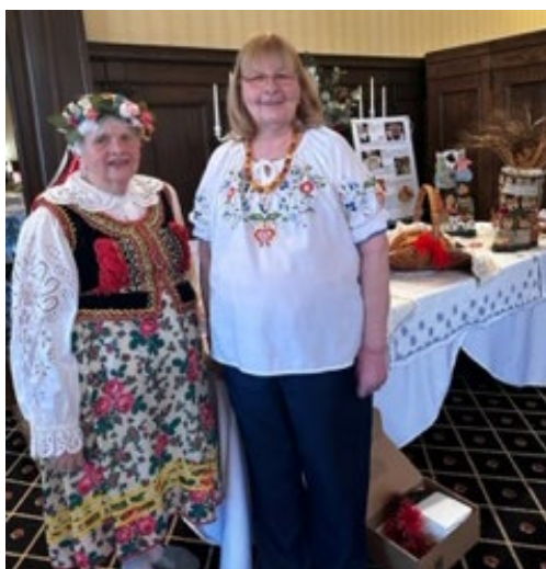
Woman's Club Tea (left) and Polish Center Christmas Bazaar (below)