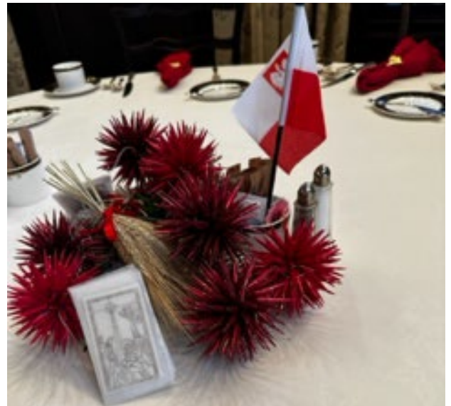
Polish Tea at the Woman's Club of Wisconsin