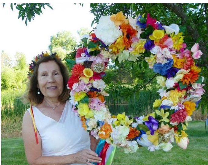
St. John's Eve Celebration, June 2022