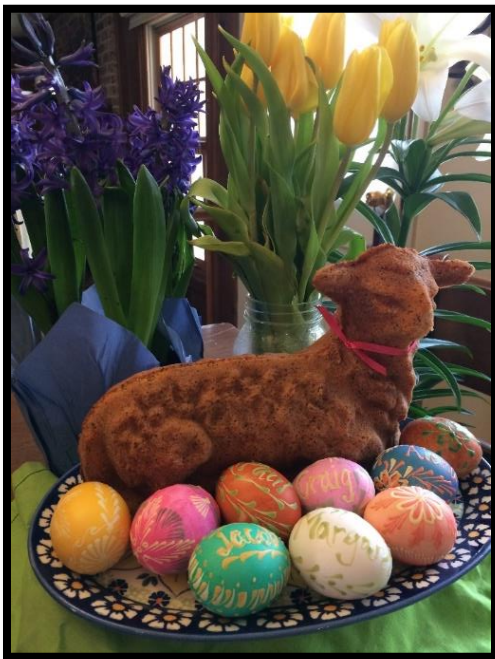
Easter

Note that members who have not renewed by May 15 will no longer receive the newsletter and will not be included in the 2021 member directory. Thank you in advance for your prompt renewals. Your continued support is important for Polanki's future success and planned activities that we hope to resume later in 2021.