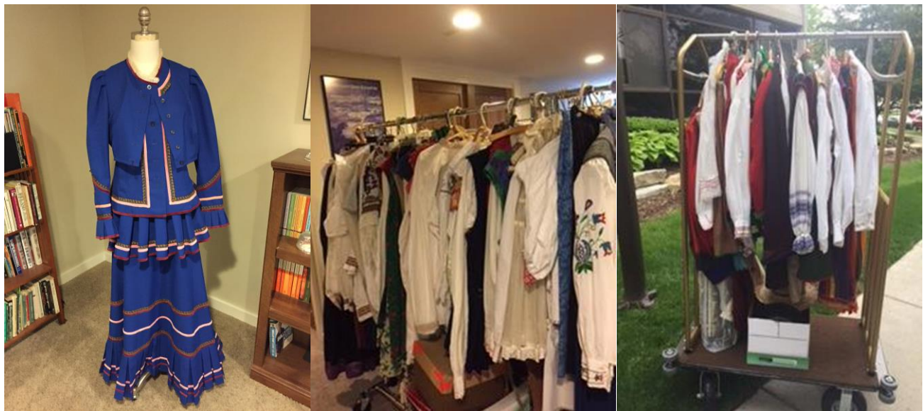
The Warmia costume on one of the dress forms purchased for displaying the costumes

Polanki should be proud to continue Ada's traditions of sharing Polish heritage throughout Milwaukee. It truly is a one of a kind collection.