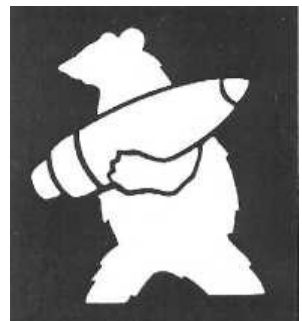
The logo of Wojtek the Soldier-Bear graced the sides of 22 nd Artillery Supply Company vehicles.

One night soldiers heard a ghastly outcry and sprang from their bunks to find a terrified howling Wojtek who had come across an unexpected Arab trying to get close to the company's weapons. In Italy, when two soldiers had a hard time lifting an ammunition crate at Monte Cassino, Wojtek easily picked it up and carried it to where it was needed. The cartoon-style logo of a bear carrying an artillery shell henceforth became 22 nd Company's trademark.